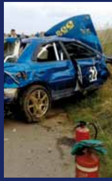
Some of the things we might do when training or marshalling and organising events in motorsport....