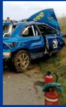
Some of the things we might do when training or marshalling and organising events in motorsport....