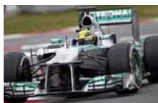
Merc continue the charge....