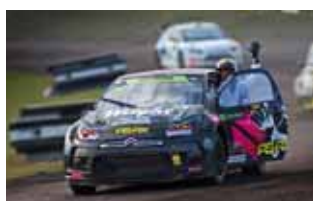
Petter back to winning ways....