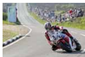
Bike world mourns before TT...