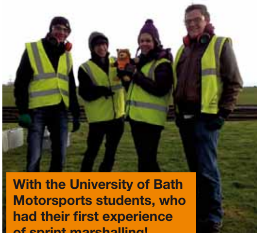
With the University of Bath Motorsports students, who had their first experience of sprint marshalling!