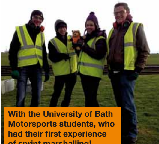
With the University of Bath Motorsports students, who had their first experience of sprint marshalling!