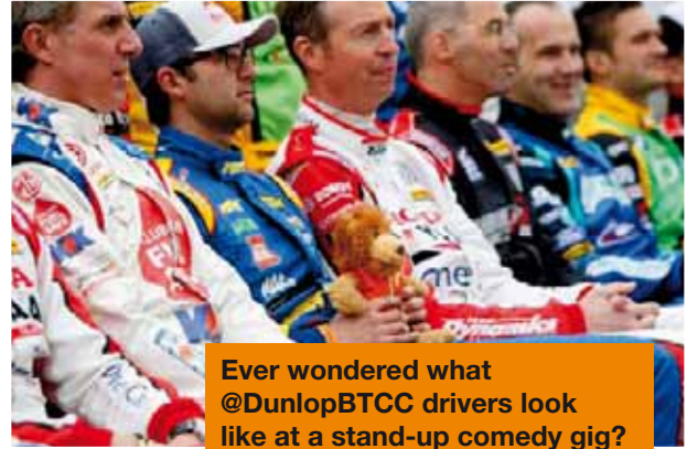
Ever wondered what @DunlopBTCC drivers look like at a stand-up comedy gig? #ThanksMarshal