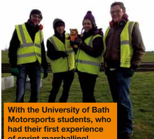
With the University of Bath Motorsports students, who had their first experience of sprint marshalling!