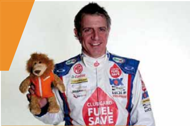
Looking forward to getting out on the banks for @DunlopBTCC this year! @jasonplato said #ThanksMarshal in advance!