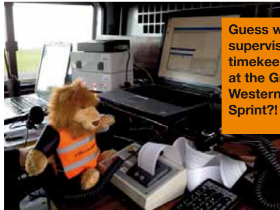
Guess who supervised the timekeeping at the Great Western Sprint?!