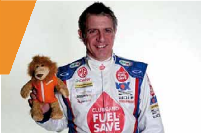
Looking forward to getting out on the banks for @DunlopBTCC this year! @jasonplato said #ThanksMarshal in advance!