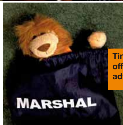
Time to head off for another adventure!