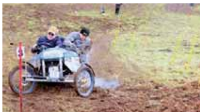
Geoff Robinson - www.2020zoom.com