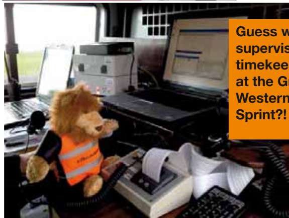
Guess who supervised the timekeeping at the Great Western Sprint?!