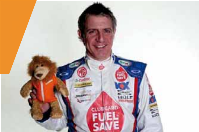
Looking forward to getting out on the banks for @DunlopBTCC this year! @jasonplato said #ThanksMarshal in advance!