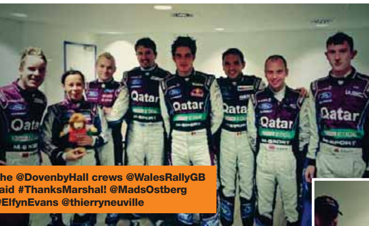
The @DovenbyHall crews @WalesRallyGB said #ThanksMarshal! @MadsOstberg @ElfynEvans @thierryneuville