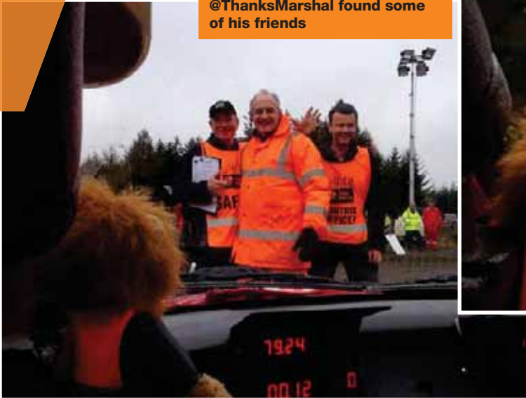
At Dyfnant @walesrallygb today @ThanksMarshal found some of his friends