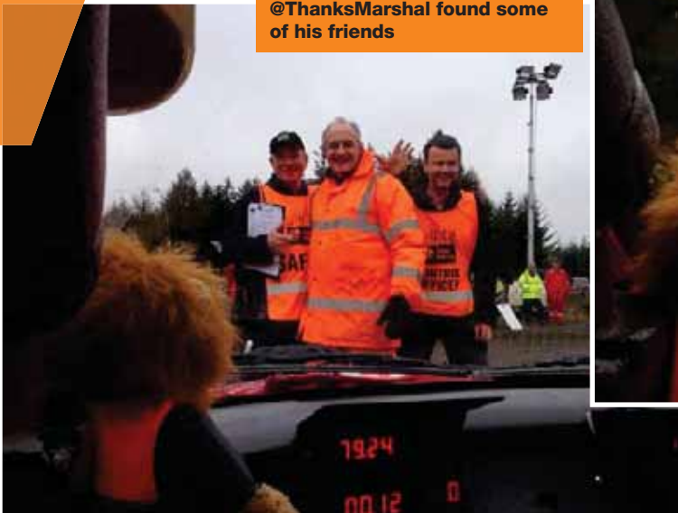
At Dyfnant @walesrallygb today @ThanksMarshal found some of his friends