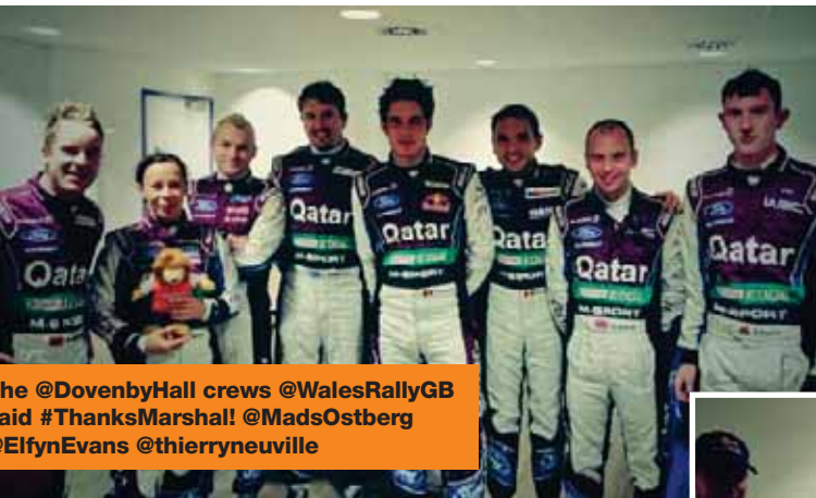
The @DovenbyHall crews @WalesRallyGB said #ThanksMarshal! @MadsOstberg @ElfynEvans @thierryneuville