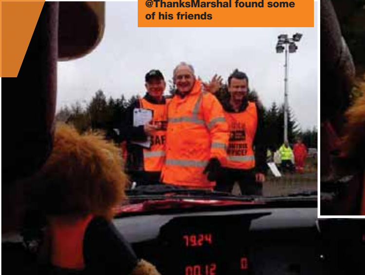
At Dyfnant @walesrallygb today @ThanksMarshal found some of his friends