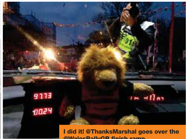
I did it! @ThanksMarshal goes over the @WalesRallyGB finish ramp