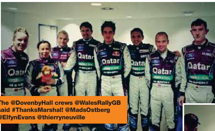
The @DovenbyHall crews @WalesRallyGB said #ThanksMarshal! @MadsOstberg @ElfynEvans @thierryneuville