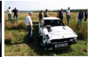
2014 looking good - as is WRC... Preston - a must for 2014... 2014 - still a seat palaver - joke!