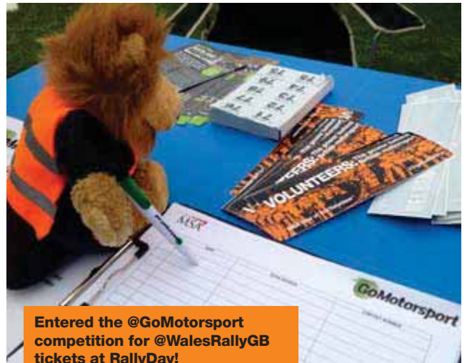
Entered the @GoMotorsport competition for @WalesRallyGB tickets at RallyDay!