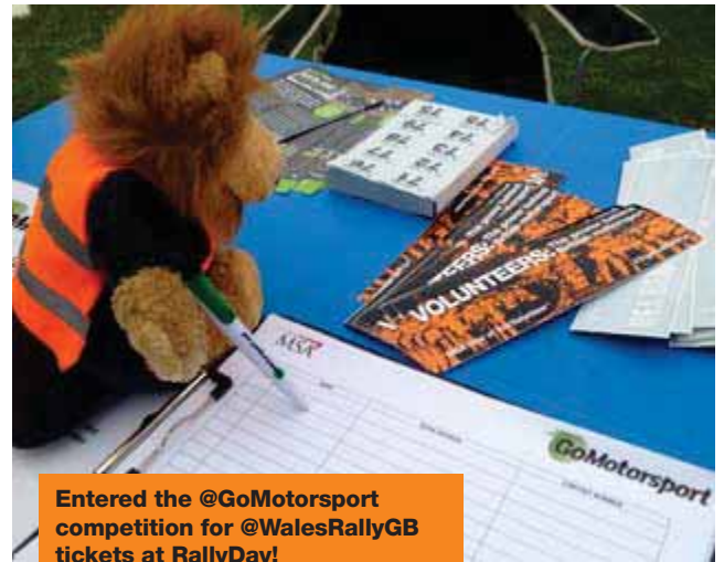
Entered the @GoMotorsport competition for @WalesRallyGB tickets at RallyDay!