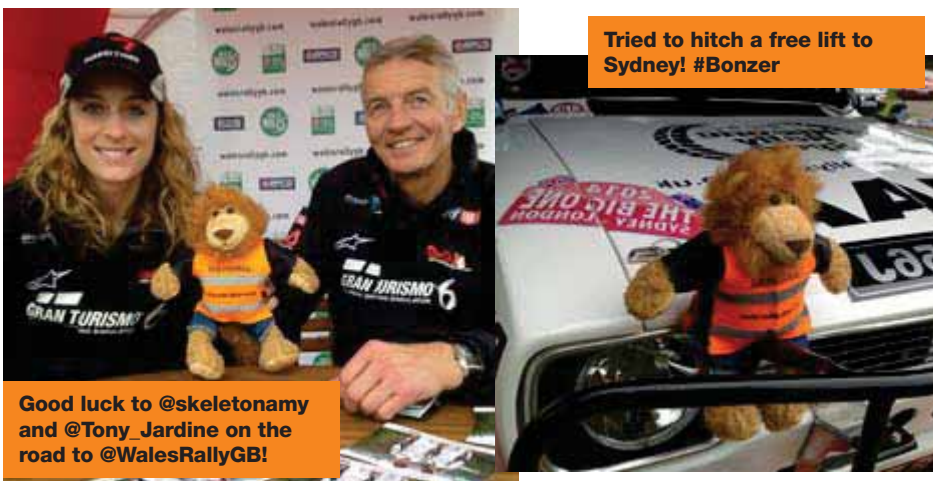
Tried to hitch a free lift to Sydney! #Bonzer