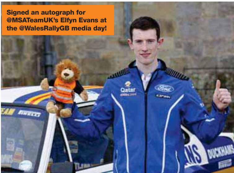
Signed an autograph for @MSATeamUK's Eifyn Evans at the @WalesRallyGB media day!