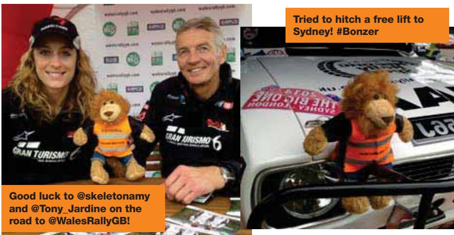
Good luck to @skeletonamy and @Tony_Jardine on the road to @WalesRallyGB!