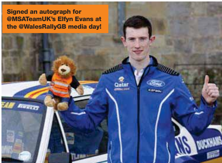
Signed an autograph for @MSATeamUK's Eifyn Evans at the @WalesRallyGB media day!