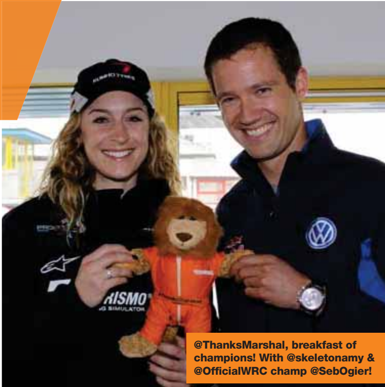
@ThanksMarshal, breakfast of champions! With @skeletonamy & @OfficialWRC champ @SebOgier!