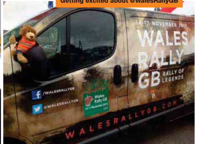
Getting excited about @WalesRallyGB