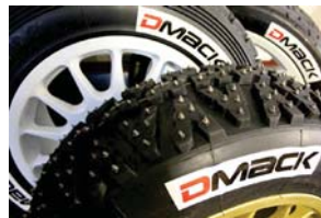
Rallying and F1 soon...