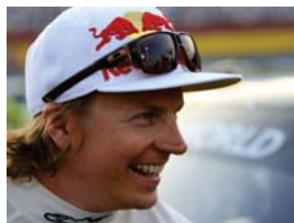
Kimi is cool as...