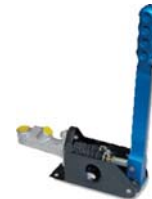
Ruining Classic Rallies...