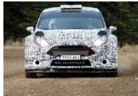
Q Code Rally Cars....