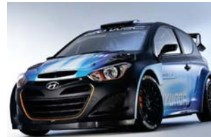
Hyundai? VW? Fiesta? Same...