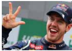
Seb makes it 3 out of 3....