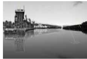
Tyne Tee won it...Plop!