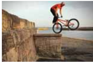
MacAskill...Legend on 2 wheels